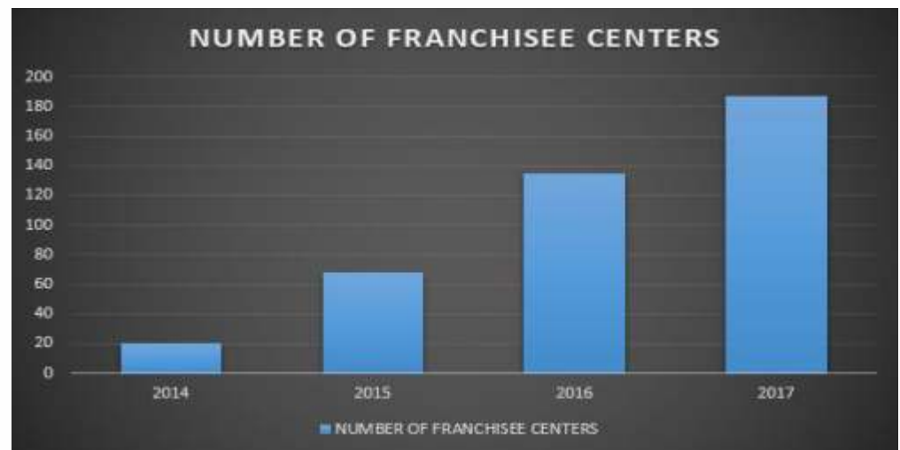
NUMBER OF FRANCHISEE CENTERS TILL 2017